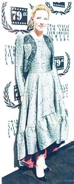
Cate Blanchett in Antonio Berardi at the New York Film Critics Circle awards

Silver is not only experiencing a recent bounceback as a commodity, it is having a fashion moment too. The Hollywood A-list may have their sights on a golden statuette at the 86th Oscars tomorrow, but it's the silver gown that is likely to sweep the board when it comes to red carpet winners.